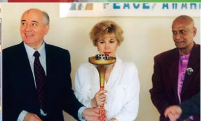
Former Soviet President, Mikhail Gorbachev , holds the torch with Raisa Maximovna, as Sri Chinmoy looks on.