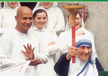
Mother Teresa and Sri Chinmoy celebrate the spirit of harmony.