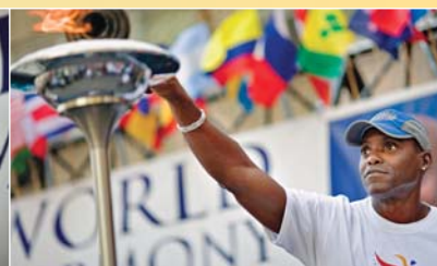
Olympic legend, Sudhahota Carl Lewis, lights the torch at the global launch in New York City.