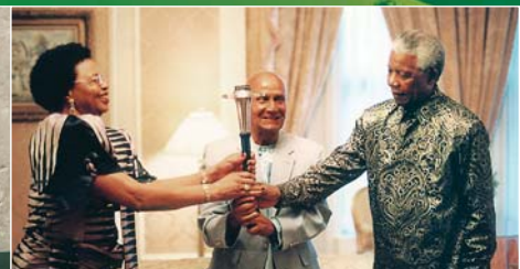
Nelson Mandela , former President of South Africa, and his wife, Mama Graça Machel, with Sri Chinmoy.