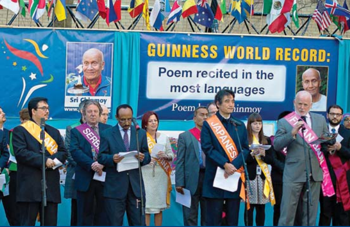
United Nations Diplomats join together to break a Guinness World Record reciting a poem of Sri Chinmoy's in the most languages at the global launch of the Peace Run in New York.