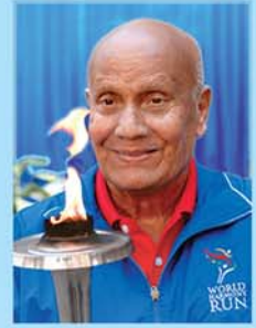
Sri Chinmoy Founder