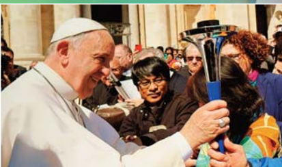
Pope Francis blesses the torch in Rome.