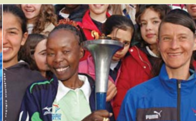
Former world record holder for the Marathon, Tegla Loroupe, with children in Italy.