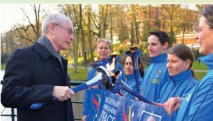
Then European Council President, Herman Van Rompuy, lights the European torches.

The Torch-Bearer Award program recognizes individual efforts by honoring peace-building pioneers from all age groups.