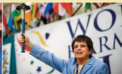
Tennis legend, Billie Jean King, participates in the global launch in New York