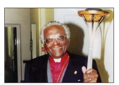
Archbishop Desmond Tutu shows his support for the Peace Run by holding the torch in South Africa.