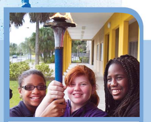
Bring together different cultures and nationalities. Appreciating our unity in diversity strengthens us as far more unites than divides us.