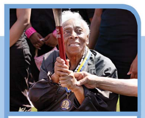
Present our Torch-Bearer Award to recognize individual and group efforts honoring peace-building innovators from all age groups.